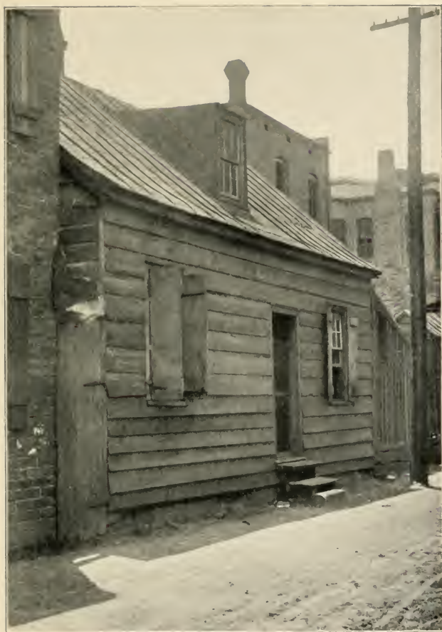
MY SCHOOLHOUSE IN SAVANNAH